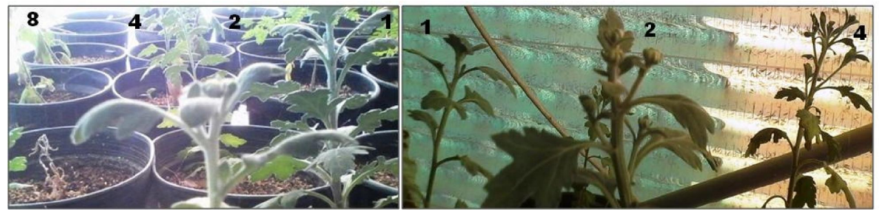
Figure 1. Growth of chrysanthemum plants under three irrigation intervals (2,4,8 weeks) compared to control (1 week).

Increment % was calculated as (end-beginning/beginning*100), Means with similar letter at the same column are not significantly different at \alpha = 0.05 .