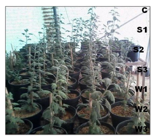
Figure 3. Chrysanthemum plants fertilized by two methods, spray (S) or watering (W) compared to control (C).

Thus, the increment rate of stem length per week at foliar spray method was generally higher than that recorded at fertigation method (Fig. 4). Number of leaves per plant was also affected by fertilizer concentration and method of application as shown in Table (2) and Fig. (4). Contrary to the effect of fertilization on stem length, there was a linear response of leaf number to fertilizer spray treatments since leaf increment % increased with the increase in foliar spray dose. The most significant increase in leaf number was recorded at 6 g/L spray treatment as compared with