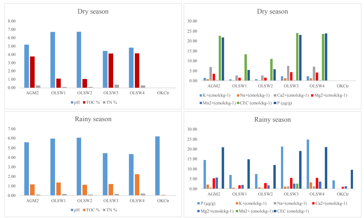
Fig. 1: Seasonal changes of selected physico-chemical parameter levels in the sediments through dry and rainy seasons.

EV = Eigen value, VAR (%) = variance percentage and CVAR (%) = cumulative variance.