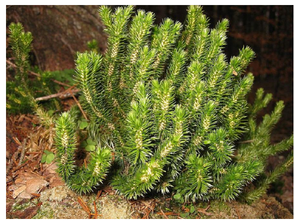
Fig 3. Huperzia selago

The Plants of genus Huperzia are terrestrial or epiphytic in nature. Rooting is present only at the base. Stem is generally erected to sub-erect or sometimes pendulous also. Branching isodichotomous type; the branches are usually ascending, symmetrical, and rarely simple. The Leaves and Sporophylls are isomorphous or heteromophous type. Strobilus or cones are not formed at all in this genus. Occasional vegetative reproduction may occur by bulbils in Huperzia spp . The Stele is typical actinostelar or plectostelar type. Sporangia are positioned in the axils of unaltered leaves all down the stem or branches, or aggregated in terminal strobili. The reproductive spores of Huperzia are trilete.