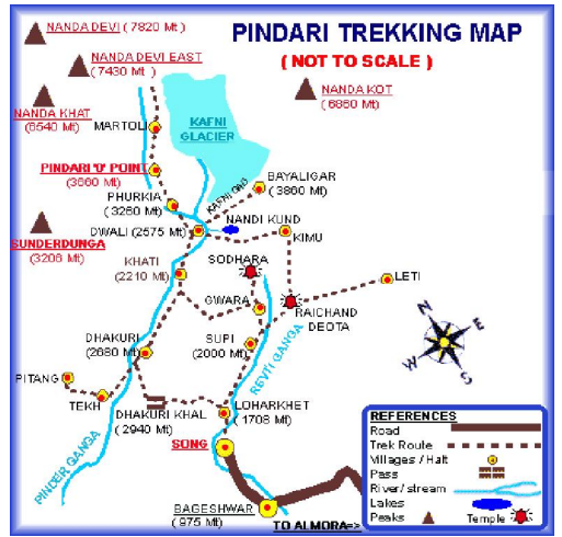
Fig 2. Study Sites: Pindari and Kafni Glaciers in Kumaon Region of Uttaranchal State (India)