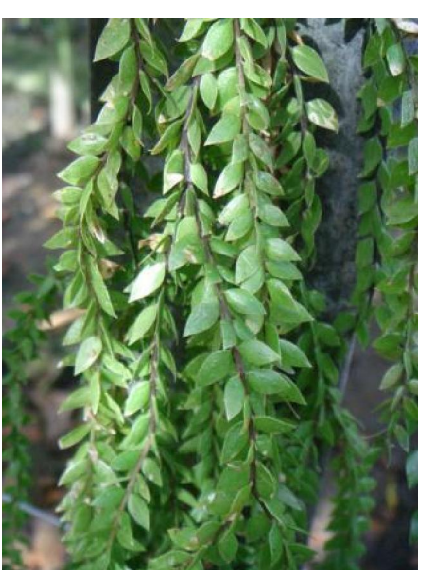
Fig 4. Huperzia hamiltonii (Spreng.)