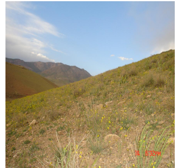
Fig 1. A part of Till rangeland from Shabestar district, East Azerbaijan province, Iran.

areas, were selected this species for test in (Table1) the Scientific and Farsi name of that species with blossoming time and local position.