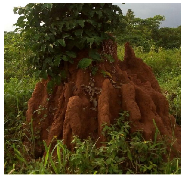
Figure 1: One of the Termitaria Prior to Sampling.

Compaction test was carried out to determine both the maximum dry density (MDD) and optimum moisture content (OMC). Both OMC and MDD values were not uniform for all termitaria as shown in Table 1. Variations in values occurred from one termitarium to the next in all the zones considered. The values of OMC obtained were used to prepared samples for shear strength and CBR tests.