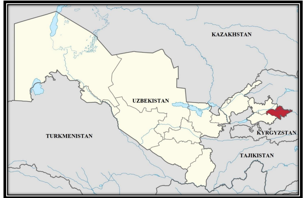
Figure 1. Location of Andijan region.

the republic. Today there are 11 cities and 79 towns in the region. Currently, the level of urbanization in the region is 52%. 30% of the total population lives in urban areas, 22% in towns, and 48% in villages.