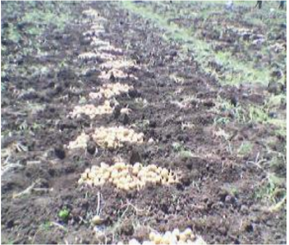
Fig 4: Potato yield of treatments irrigated every 26 days with application VH