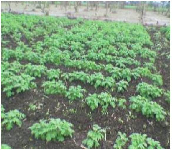
Fig 2: Potato plants irrigated every 15 days intervals without application VH