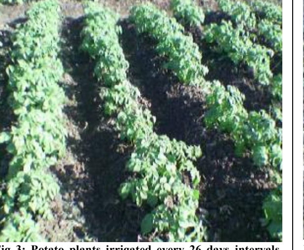
Fig 3: Potato plants irrigated every 26 days intervals with application VH