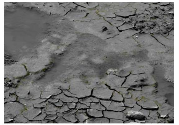
Fig. 3. Mudskippers are probably the only fish with huge eyes for an all-over view.