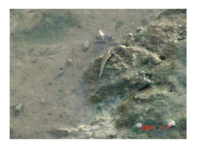
Fig. 6. The mudskipper needs to be out of water to feed and keep his skin wet.