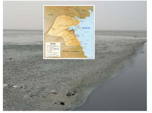
Eig 1 Kuwait Bay choreline and mudflat State of Kubit K

Other adaptation of mudskippers to life on land is their huge goggly eyes at the top of their heads for an all-round view, while their mouth faces downwards to feed on the mud surface. These eyes sit on stalks while the rest of their bodies remain safely underwater. Unlike other fishes, mudskippers prefer to swim with their heads above water, their eyes giving them a good 360-degree view. To keep their eyes moist when they are on land, the eyes can be retracted to dip them into water that collects at the bottom of the eye socket. Mudskippers are probably the only fish with movable eyelids (Fig. 3). The pectoral fins of the mudskippers are used like crutches to crawl over mud.