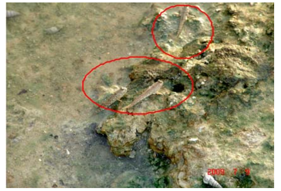
Fig. 4. Walled territories.