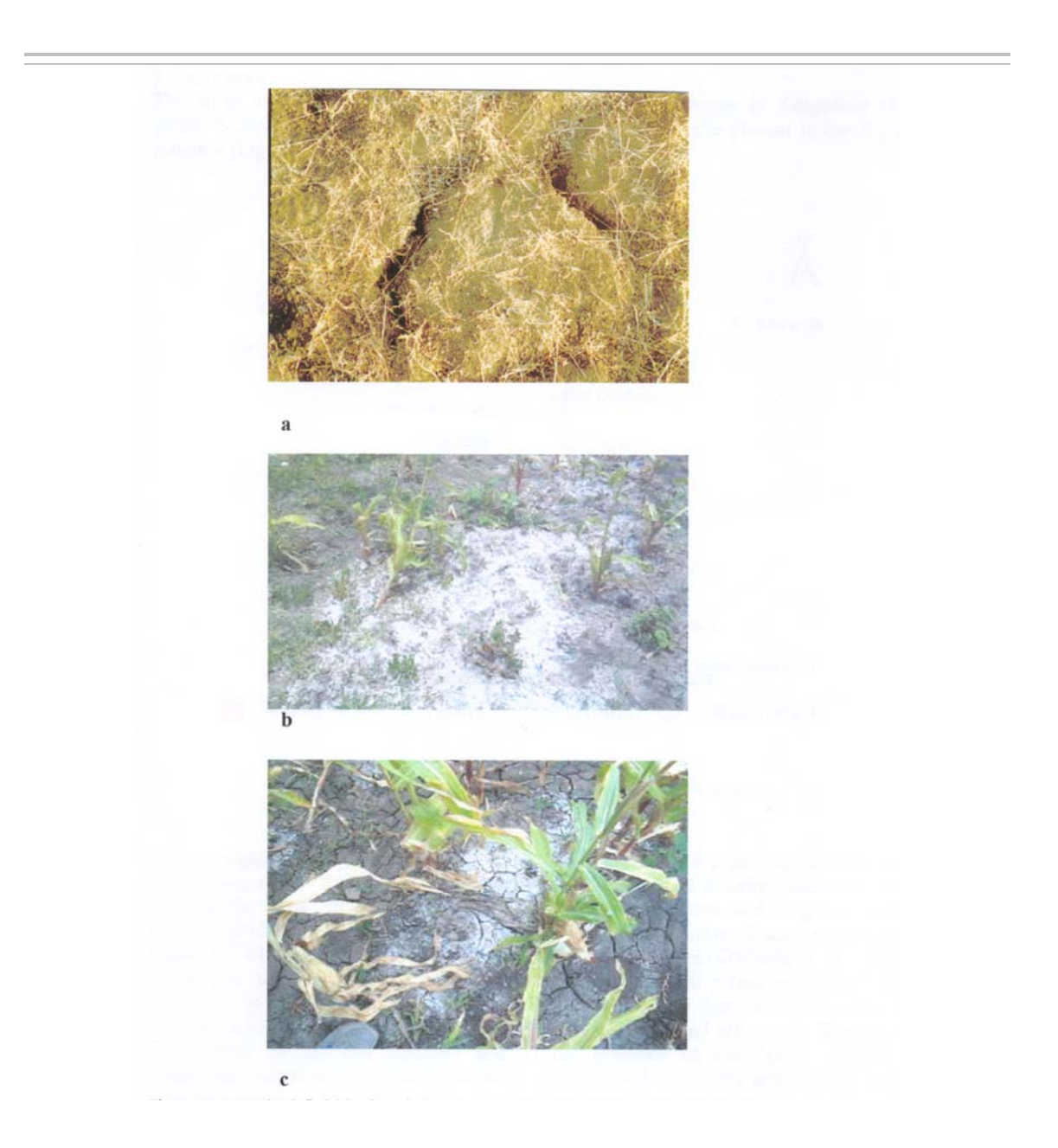
Fig 1. a) Vertisols field before irrigation and b & c- salt patches developed under maize cultivation after irrigation, Adigudom, North Ethiopia