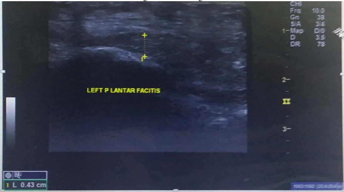
Fig. 2: B Mode US scan with longitudinal view shows measurement of left planter fascia thickness at insertion of the calcaneus of 4.3 mm before ESWT treatment in patient with chronic plantar fasciitis. It also appears hypoechoic relative to the subcutaneous fat plane.