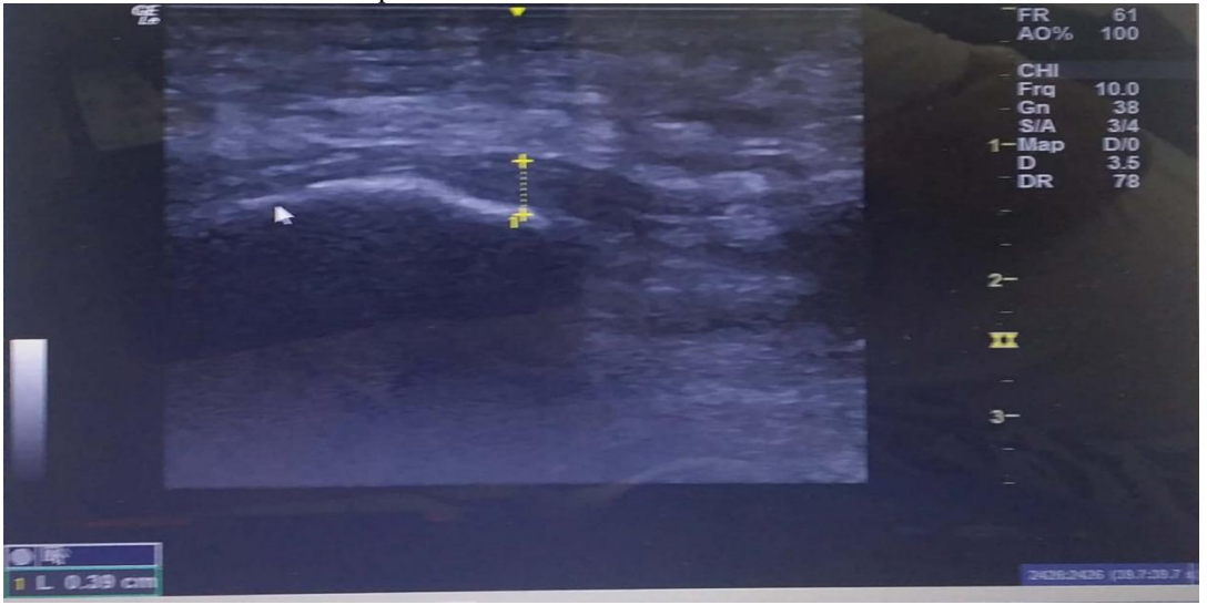
Fig. 3: B Mode US scan with longitudinal view—shows reduction left planter fascia thickness at insertion of the calcaneus of 3.9 mm at 1.5 month after ESWT treatment in patient with chronic plantar fasciitis. It also appears hypoechoic relative to the subcutaneous fat plane.