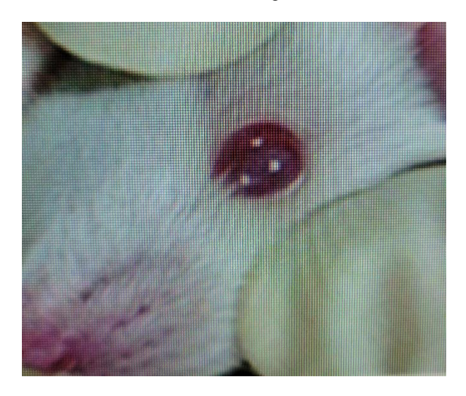
Fiig. 2. This therapy was considered a "success" when the cataract was not found on examination by the naked eyes.