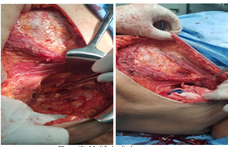
Figure (1): Modified radical mastectomy.