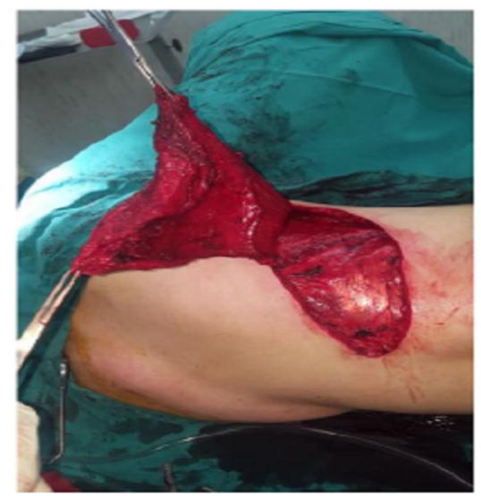
Figure (5): Elevation of the harvested flap.

The muscle with the overlying fat was then separated from all its attachments except at the intertubercle groove insertion and now mobilized to the chest wall through a subcutaneous tunnel which is wide enough to introduce four fingers to reach to the site of reconstruction. Care was also taken not to disturb the inframammary fold. (Figure 5).