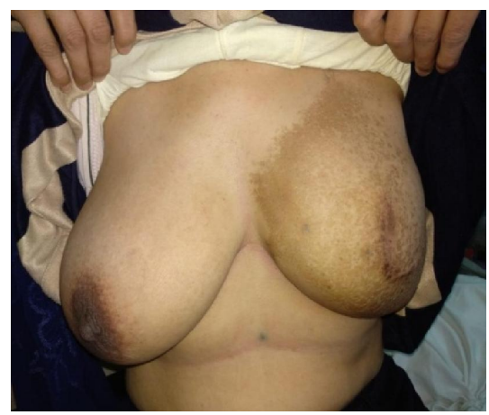
Figure (15): Follow up after one month.