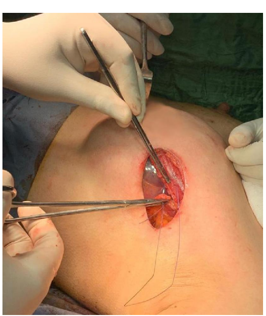
Figure (11): Suturing the lateral border of pectoralis major to serratus anterior muscle.