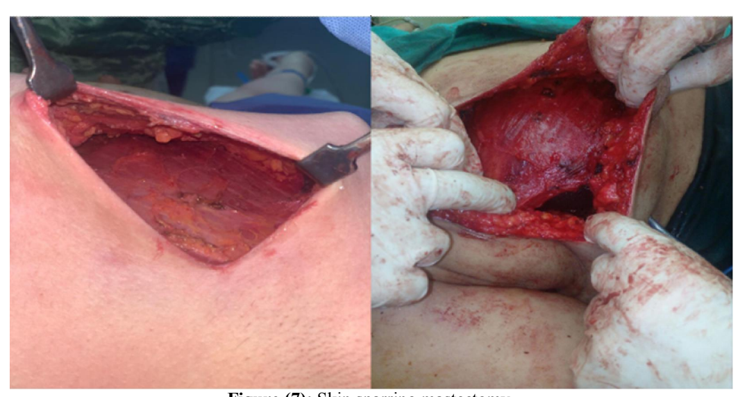
Figure (7): Skin sparring mastectomy.

All breast tissue along with the NAC were removed through a surgical plane developed between subcutaneous fat and the breast tissue. the preservation of the inframammary fold and as muchnative skin envelop as possible is done to optimize the aesthetic outcome of the reconstruction. (Figure 7).