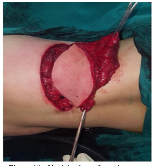
Figure (4): Obtaining large flap volume.