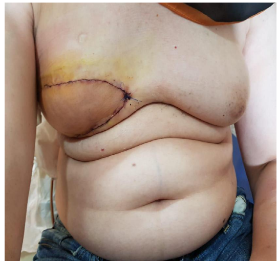
Figure (16): First post operative dressing showing good vascularity of flap with fair symmetry of both breasts.