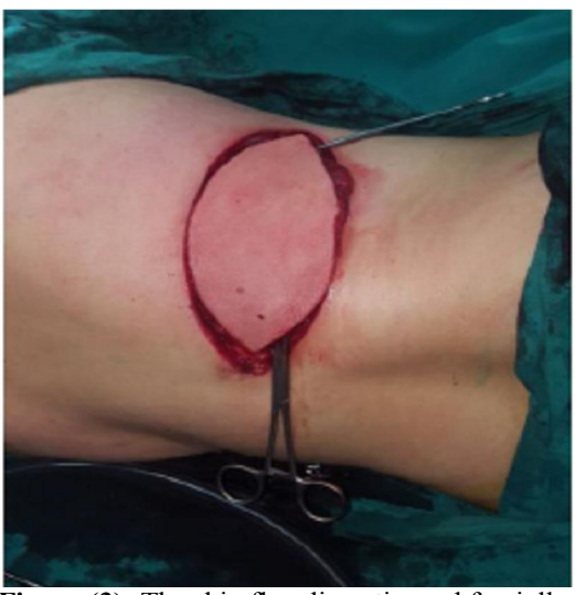
Figure (3): The skin flap dissection subfascially.

The muscle was then divided as usual from its attachments into the iliac crest and the thoracolumbar fascia. Separation of the anterior border from the underlying Serratus anterior muscle was then done carefully. To keep the pedicle protected by some fibers of the muscle and at the same time minimize the axillary bulk, the insertion of the muscle into the intertubercle groove on the humerus was sub to tally divided. This technique also allows for more reach of the muscle.