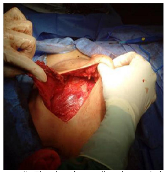
Figure (9): Elevation of pectoralis major muscle from its insertion.

For placement of the implant medially, the pectoralis major muscle was raised from its insertion at the level of the fifth rib (Figure 9). It may be important also to raise part of the anteriorrectus fascia, in continuity, to make complete coverage. This has to be done with consideration that this layer is often thin and friable.