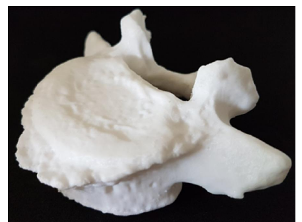
Figure 1. A 3D printed model of a lumbar vertebra showing osteophytic lipping.

showing both anatomical variation and pathologies (Fig. 1) (AbouHashem et al., 2015). As the material used in standard 3D printers is of low cost, once the infrastructure is in place 3D printed bones are acquired at a significantly lower cost than commercial anatomical models. Furthermore, just like the models, and unlike the real tissue, 3D prints can be used in any educational environment.