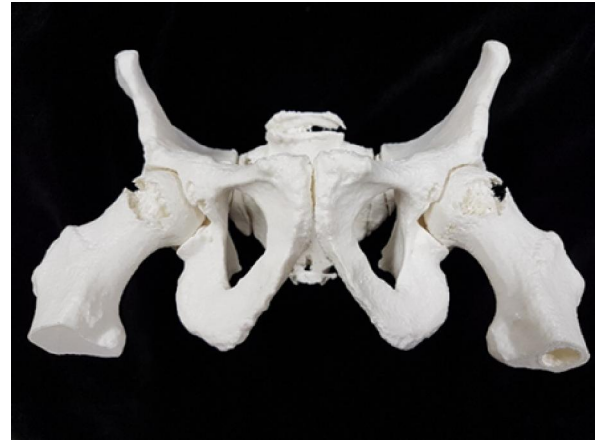
Figure 2. A 3D printed model of a pelvis and proximal femora (image obtained from a CT scan).

Once the bones were produced their accuracy was estimated using both qualitative and quantitative methods. Qualitatively, a visual observation was made by four anatomy lecturers. They were unanimous in their estimate that all important morphological features are clearly visible on the 3D printed bones, deeming them accurate for anatomy teaching. In quantitative approach, a battery of measurements was carried out in order to compare the prints with the "original" bones upon which they were produced. This test also corroborated the accuracy necessary for anatomy teaching as there were no significant differences between prints and bones in 96 out of 108 measurements (AbouHashem et al., in print). It generally confirmed the results of previous studies which suggested that inaccuracies generally happen only in very small structures (e.g., less than a millimeter) (McMenamin et al., 2014; Thomas et al., 2016).