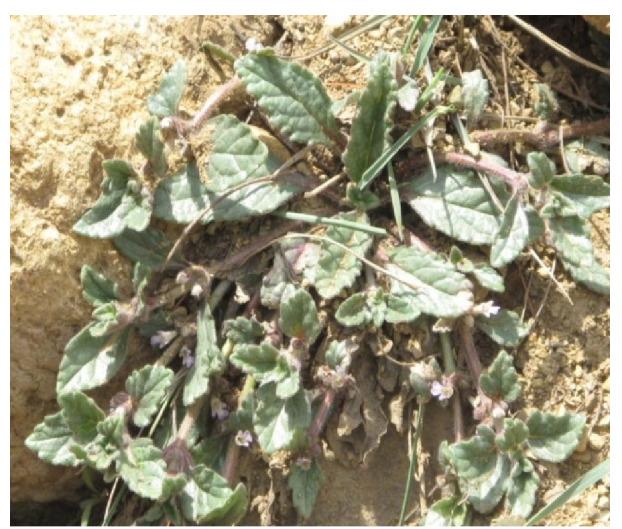
Fig.1: Habit and habitat of A. bracteosa

Perennial herb upto 15-40cm long, stoloniferous; stems branched from base, gray villous or lanatevillous especially on young parts; basal petioles 1-1.5 cm; basal leaf blade spatulate to oblance late, 2-4 \times 0.7-1.2cm; stem blades sessile or subsessile, obovate to subcircular, 1-1.5 \times 0.6-1 cm, pilose or strigose, base cuneate-decurrent, margin inconspicuously to irregularly undulate-crenate, ciliate, apex obtuse to subrounded; basal verticillasters widely spaced, apical verticillasters in dense spikes; basal floral leaves densely lanate-villous, incised. ciliate: calvx campanulate, 4.5-6mm, villous especially on teeth; teeth subulate-triangular, regular, 1/2 or more as long as calyx, apically acute, margin villous-ciliate; corolla purple or purplish with dark purple spots, tubular, slightly exserted, puberulent, yellowish glandular, villous annulate inside; upper lip straight, apex emarginate; middle lobe of lower lip obcordate, lateral lobes oblong: nutlets oblong to oblong-obovoid. adaxially swollen at middle, areole to 2/3 or more as long as adaxial side of nutlet (Fig.1). Common name: Jan-e-adam