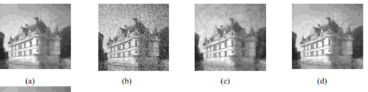
Fig. 1. (a) The original image. (b) The noised image by adding Gaussian noise with sigma=20. (c) denoised by K-SVD and (d) denoised by using SR-NNMF, (e) denoised by using MSDL-CS.