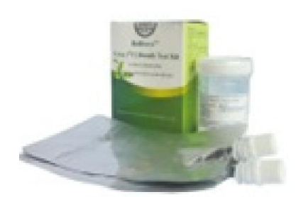
H. pylori rapid test (C13) Urea breath test kits

b) Third generation immune-enzymometric assay employing Streptavidin-Biotin-based system was used to perform ELISA for diagnosis of H. pylori. The commercially available Anti-H. Pylori-IgG, M icroplate ELISA kit (Monobind Inc., USA) was used in this study.