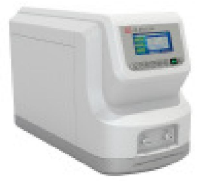
Machine: IR-FORCE 200 CHINA

Individuals who had positive H. pylori IgG immunoassay in both groups were further tested for the presence of active and/or chronic H. pylori infection by urea breath test.