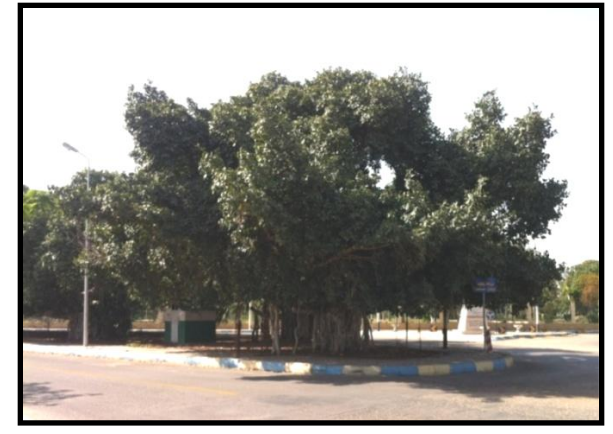
Figure 2: F. benghalensis trees in Ismailia roads.

Figure 1: Map showing the four studied localities of F. benghalensis chosen for study in Ismailia.