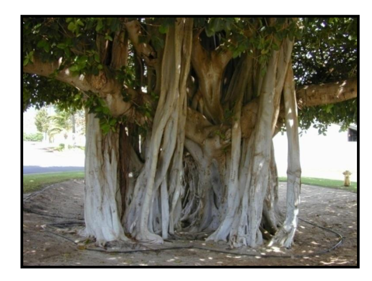
Figure 3: F. benghalensis aerial roots in one of the four studied area in Ismailia.