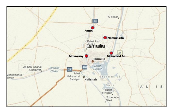
Figure 1: Map showing the four studied localities of F. benghalensis chosen for study in Ismailia.