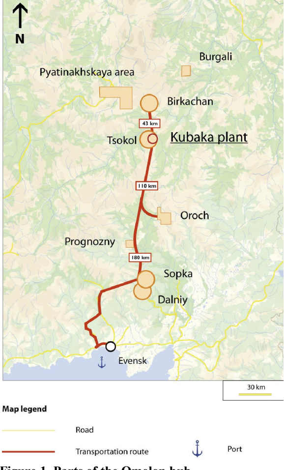
Figure 1. Parts of the Omolon hub

October-December 2012 also confirmed the effectiveness of joint processing of these ores. Flocculant A331 was used for thickening the ores.