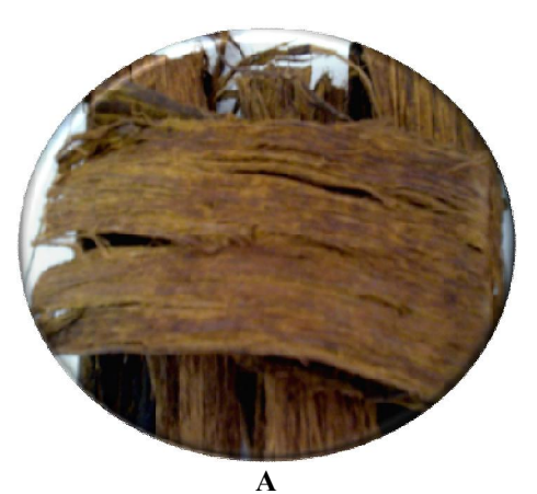
Figure 1. Plant material: Juglans regia L. (A): natural bark; (B): colored bark.

The root bark's of Tunisian J. regia L. was tested for its antifungal activity against vaginal Candida strains. The plant material was purchased from a local supermarket from the region of Menzel Bouzalfa, Nabeul (Tunisia). Harvesting was carried out in December 2010. Two types of bark were tested: natural untreated bark and treated bark with a food yellow dye that also was tested for its anti- Candida activity (Figure 1).