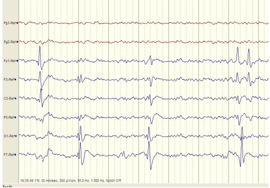
Fig 2. The ECoG wave during surgery.