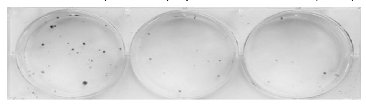
Figure 2: Colony formation in the MCF-7 cell line.