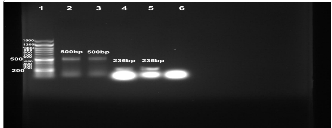
Figure (2) Showing the results of prawn specimens infected with (XSV) by using nested RTPCR and two steps multiplex RTPCR for both virus (MrNV and XSV). Lane (1) molecular weight marker (1500bp). Lane (2) and lane (3) showing prawn specimens results were positive for XSV (500bp) and negative for MrNV by two steps multiplex RTPCR. Lane (4) and Lane (5) showing prawn specimens results were positive for XSV by using nested RTPCR (236bp). Lane (6) results were negative for XSV by two steps multiplex RTPCR.

Figure (1) Showing the negative results for the two viruses (MrNV and XSV) by using One step multiplex RTPCR using (BioRT One step RT-PCR kit). Lane (1) molecular weight marker (1500bp), Lane (2) control negative, Lane (3), Lane (4), Lane (5), Lane (6) and Lane (7) prawn specimens gave negative results (no bands for MrNV and XSV)