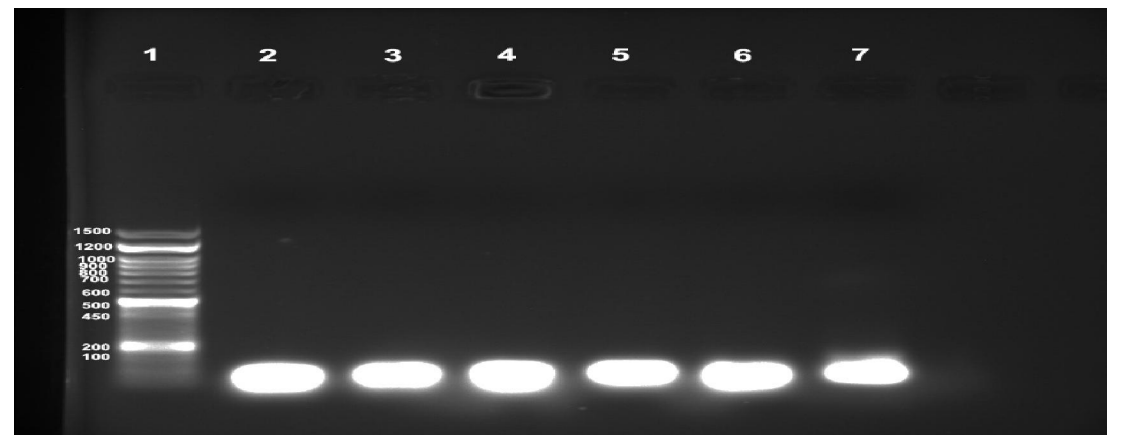
Figure (1) Showing the negative results for the two viruses (MrNV and XSV) by using One step multiplex RTPCR using (BioRT One step RT-PCR kit). Lane (1) molecular weight marker (1500bp), Lane (2) control negative, Lane (3), Lane (4), Lane (5), Lane (6) and Lane (7) prawn specimens gave negative results (no bands for MrNV and XSV)