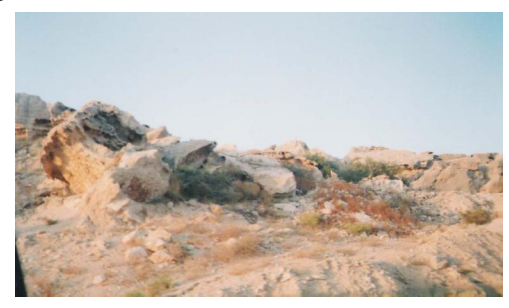
Figure 2: Khark Coral reefs and geolog