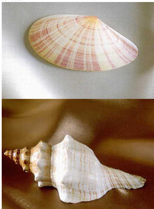
Figure 6 & 7: Khark Seashells

Therefore; it is necessary to pay attention and emphasize on ecotourism; by considering environmental potentialities in cultural tourism and ecotourism not only the problems of the local people will be solved but also it prepares the situation to attract tourists from other provinces in Iran and abroad.