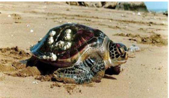
Figure4: Khark Wildli

by snow. Herds of gazelles and birds' garden are some examples of the wildlife in the islands; also the marine life on the seashores, floating algae and algae covering the rocks, croks which are the place of living for different species of fish and mollusk, in these places birds, tortoises and lobsters lay eggs; all of the above mentioned are the ecotourism potentialities of these islands.