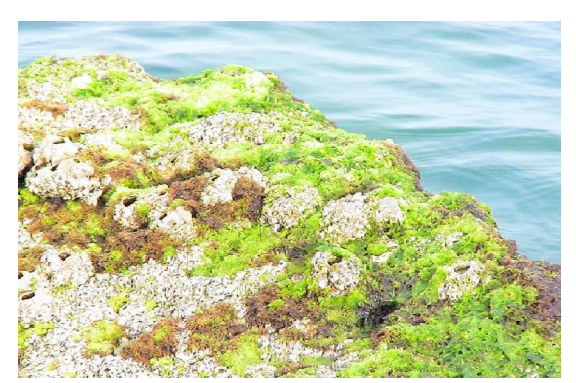
Figure 3: Algae growing on the rocks in Khark Island