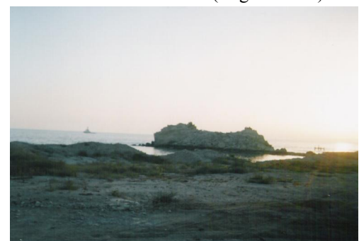
Figure 1: Khark Coastal reefs

Khark island seashores are made of coral calcareous stones is like a strip of sand and stones which have been made by sea erosion and weathering. The low altitude seashore are in the south and part of the west and also in the northwest of the island and their altitude are about 5m to 500m. Almost all of the parts in the northeast and east seashores have got low altitude which is less than 5m.( Figures 1&'2)