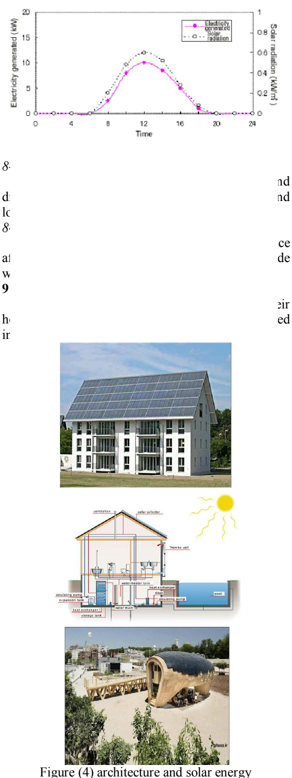
Figure (4) architecture and solar energy

the living conditions. Solar radiation can be divided into two categories: 1 -direct radiation -2 radiations scattered