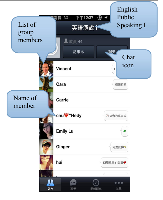
Figure 1. A sample interface of the LINE group on mobile phone for EPS course I

The English Public Speaking (EPS) class was an 18-week long course. The instructor (the researcher) divided the 18 week instructions into two parts: the first 12 weeks of class with various speech topics, and the last four weeks of class with 2 environmental protection related topics. The first 12 weeks of class, a blended teaching model was employed with LINE presentations and traditional inclass presentations. In the first week of class, the instructor asked all the students to install LINE to their smartphones and then created a closed group in LINE application (Figure 1).