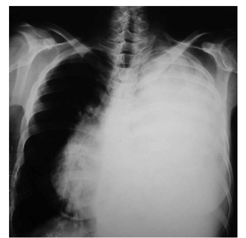
Figure 2. Chest X-ray showing a giant pulmonary hydatid cyst filling the left hemithorax shifting the mediastinum and heart to the right