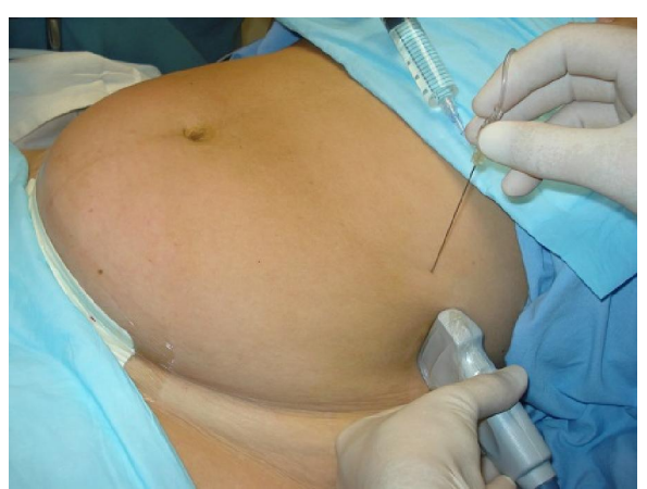
Figure (1): Using strict aseptic technique, the ultrasound probe was covered by a sterile plastic cover and placed in the midaxillary line just superior to the iliac crest.