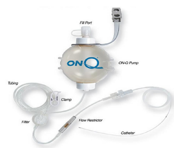
Figure (3):ON-Q Pain Buster®