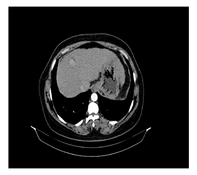
Figure 3: Shrunken liver showing established cirrhotic changes with 3cm hepatic focal lesion noted at right lobe that expressed moderate homogenous blush enhancement at HAP phase

In group II patients (HCC cases) triphasic CT revealed solitary hepatic focal lesion in 28 patients and multiple hepatic lesions in 2 patients. The lesions showed blush enhancement in the arterial phase with washout at the venous and delayed phases (Figs. 3 and 4). Furthermore, a significant positive correlation was observed between lesion size and each of VEGF and TGF- \beta 1 in group II patients (r= 0.62 and 0.40, respectively) (p= 0.000 and 0.02, respectively).