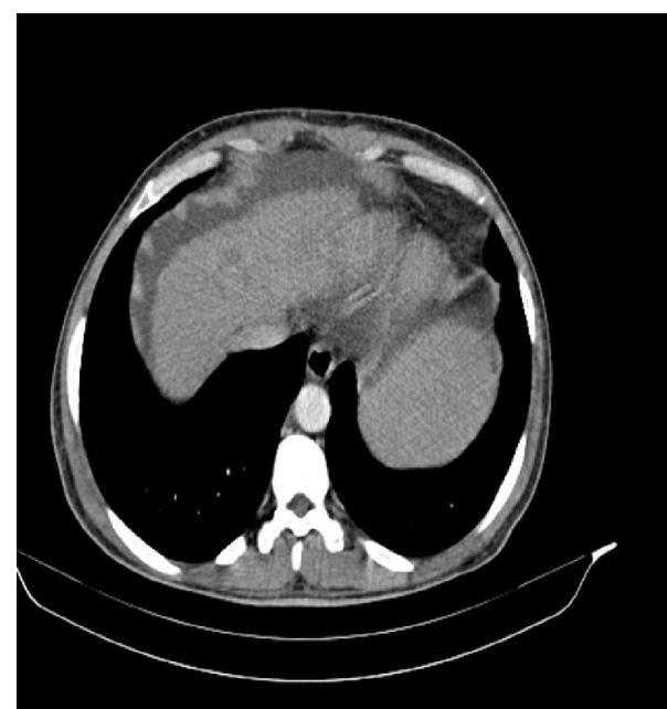
Figure 4: Shrunken liver with established cirrhotic changes and medium sized 4x 4cm expanding hepatic focal lesion affecting area VIII of right hepatic lobe that expressed mild heterogeneous capillary blush enhancement at the late HAP

Figure 3: Shrunken liver showing established cirrhotic changes with 3cm hepatic focal lesion noted at right lobe that expressed moderate homogenous blush enhancement at HAP phase