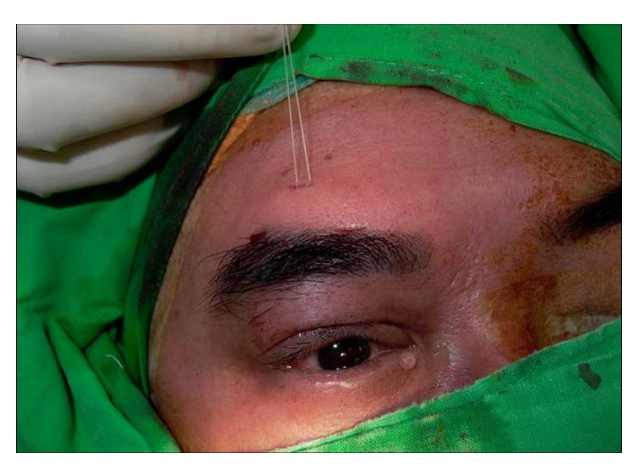
Fig. 3. Silicone frontalis sling repair of ptosis: final adjustment of lid position at frontal incision