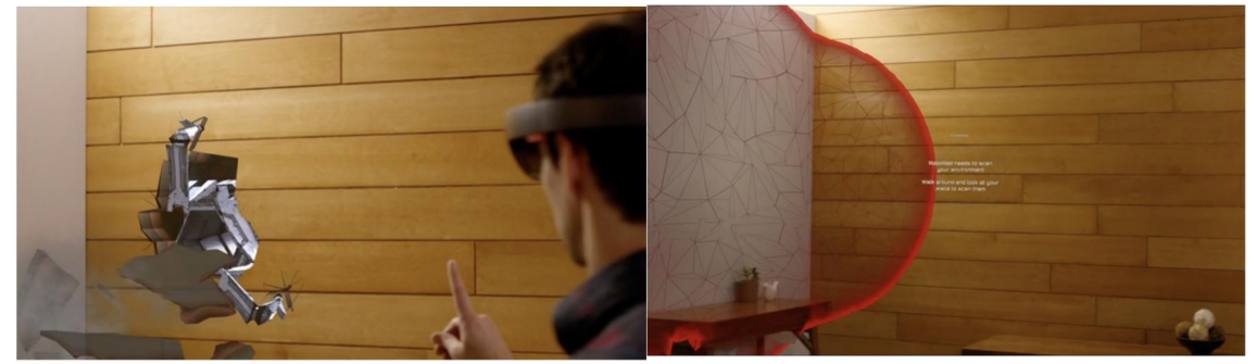
Figure 2, Figure 3 RoboRaid game interface

and the player's line of sight, and detect and project the aiming center according to the real-time position. When the player's thumb and index finger touch, the firing function will be triggered along the center direction, and the hit object will respond immediately (explosion disappears, etc.), providing the player with timely feedback and smooth interactive experience.