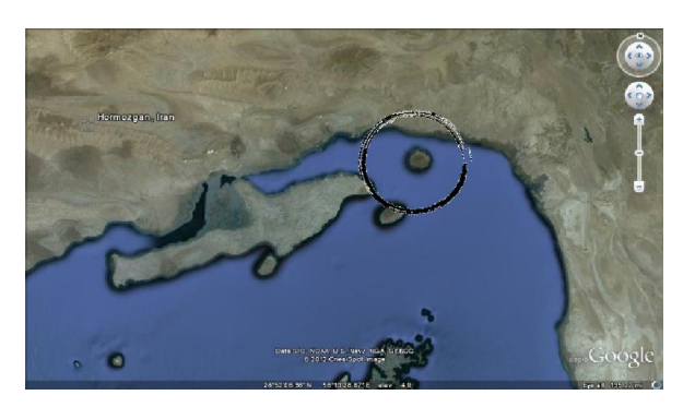
Figure 4: Location of Hormoz Island,Hormozgan Province