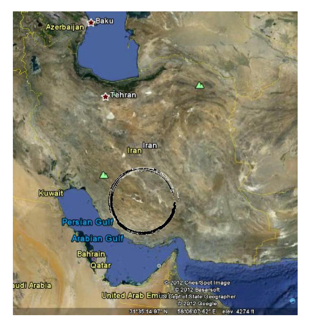
Figure 3: Location of the Iranian islands of Hormoz