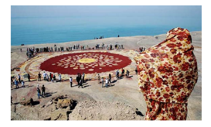
Figure 5: carpet created by artists with colorful soils of the island in coast of Hormoz Island

colors of this island are result of a chemical composition, result of an event i.e. composition of different minerals for formation of stone, colors of Hormoz or as soil and lump or as solid stones. Of course, Hormoz has also metal rocks. Magnetite, hematite and oligiste are three metal rocks in which iron oxide and a golden metal rock called pyrite which is known as fool's gold or eye of Satan are found and they have a material called iron sulfide. Many artists paint a carpet of soil with different colors of the Island's soils in coast of this island in different occasions and some of the works are given in figure 5 and 6.