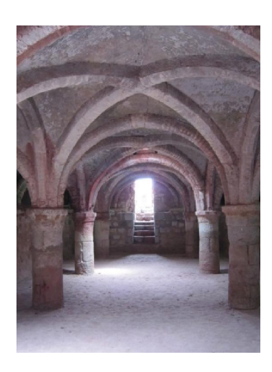
Figure 14: cistern of the Portuguese Fortress