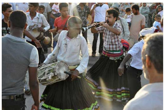
Figure 9: A sample of weaving as handicraft of Hormoz Island

Pottery, matting, net weaving, production of all traditional weavings (khos weaving, silk weaving, silver thread weaving) are of the handicrafts which have been popularized by residents of Minab in Hormoz Island. At present, 50% of the women residing in the island are fully familiar with these weavings. In 1983-1984, Construction Organization started teaching carpet weaving in the island and could introduce some of the women in this island to this field of handicrafts with 10 frames. Net weaving and gargoor weaving are of the activities which were performed by women and men in the past. All kinds of lee (coarse net) and jol(fine net) are woven by the residents. In the past 30 years, small wooden boats called Manshooreh were produced using lote or acacia wood. In the past, simple and primitive pottery and matting were common in the island (Boucharlat & Salles, 1981).