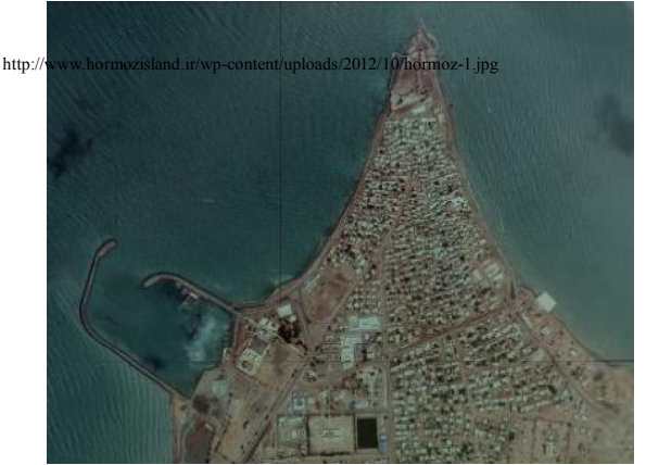
Figure 11:urban tissue of Hormoz Island

Historical places and spectacular centers of this island include Portuguese Fortress located in the city which was constructed in Hormoz Island after domination of Albuquerque, poerogese admiral in 1507 at time of kingship of Shah Esmaeil Safavi and sovereignty of Seifoddin, a young king, Tolombeh Khaneh Park with area of 4000 sq meters and Marine Environment Research Center located in 8 km of southeast of Hormoz city, ruins of old school, ruin of old Hormoz city in north of the island near Portuguese Fortress, Bibigol Castle , Soorat Castle , Saffron House, Tirandaz Tower, Naghoos Tower, Hazrat Khidr Shrine and Tombstones.