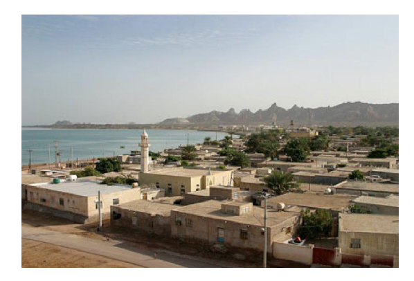
Figure 12: Using wood craved doors in traditional houses

http://www.wwwebart.com/riverart/hormoz/heritage/wood_door_hormoz.jpg