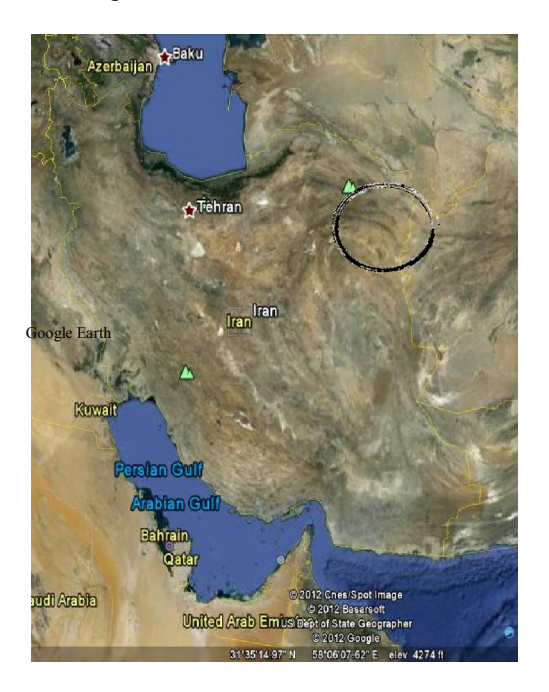
Figure 3: Position of Hormoz Island in Hormozgan Province