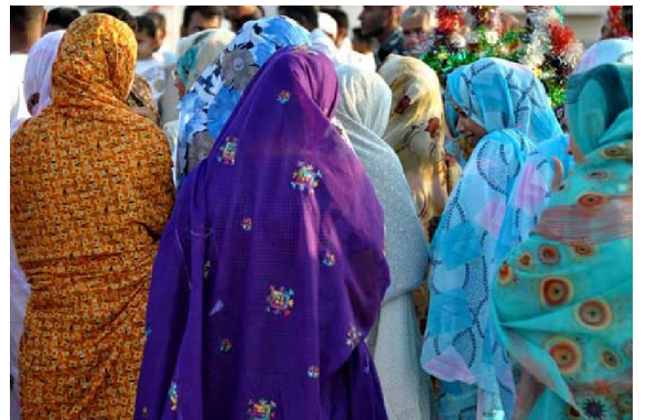
Figure 8: Costumes of men in wedding ceremony http://www.wwwebart.com/riverart/hormoz/local_cul ture/wedding_hormoz_1.jpg

http://www.wwwebart.com/riverart/hormoz/local_cul ture/wedding_hormoz_5.jpg