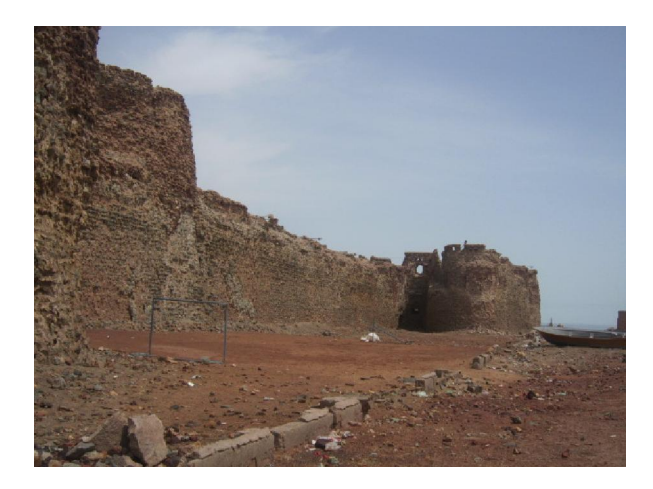
Figure 15: the Portuguese Fortress