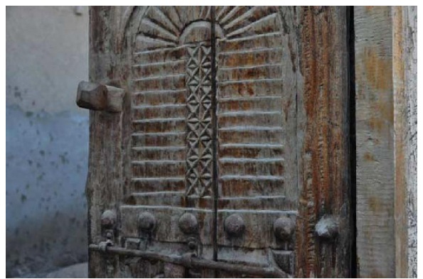
Figure 10: urban zone of Hormoz Island in north of the island

Urban zone of Hormoz Island is located in northern coastal strip adjacent to historical Portuguese fortress. In fact, development of dwelling place adjacent to the above building is shown in Picture 9.