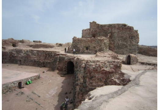
Figure 13: internal facade of the Portuguese Fortress

(conqueror of the island) as a European fortress in the late Middle Age. Total area of this building is 7200 sq. meters (80×90) (Bakhtiari, 1979).