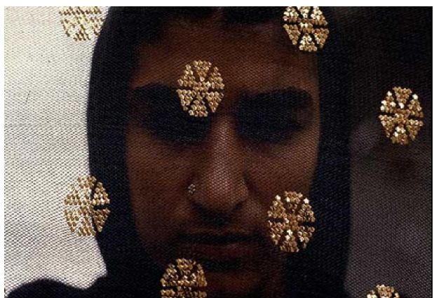
Figure 7: Veil of women in Hormoz Island with different colors

Images of women and men with costumes in Hormoz Island (Figure 7 to 8).