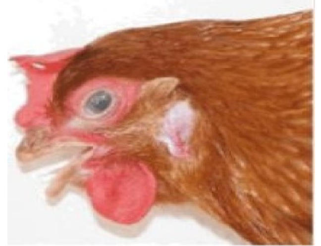
Figure 5: Opacity of eye lenses (cataracts) in old chicken after infection (Rocha, 2019).