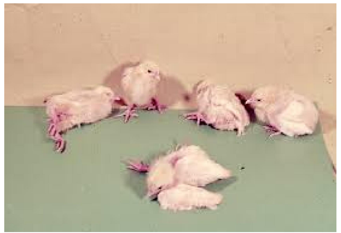
Figure 2: Neurological sign in day old chicken affected through vertical transmitted AE