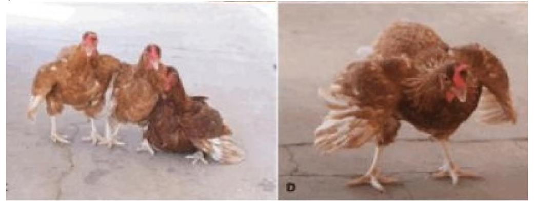
Figure 4: Neurological sign in old laying hens (Rocha, 2019).