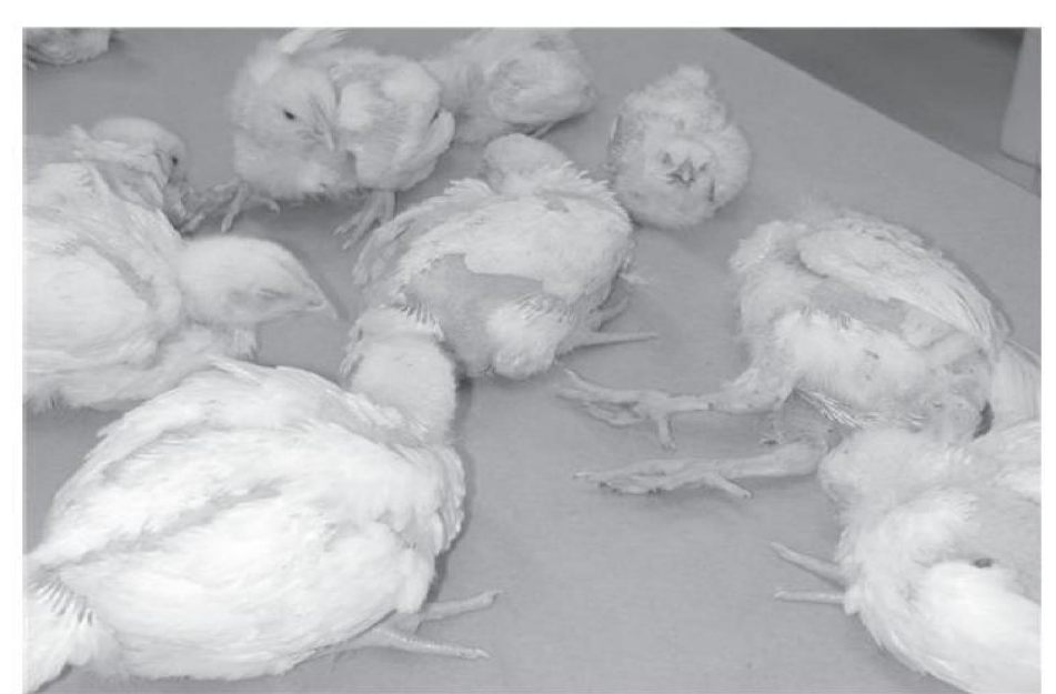
Figure 3: Two-week-old broiler presenting neurological signs of avian encephalomyelitis virus infection (Freitas and Back, 2015).