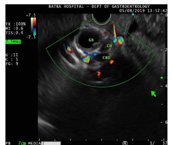
Figure (3): by EUS, view of GB, Cystic duct and CBD.

Post operative assessment: There is no postoperative complication in the form of obstructive jaundice (missed CBD stone) or iatrogenic biliary injury (bile leakage).