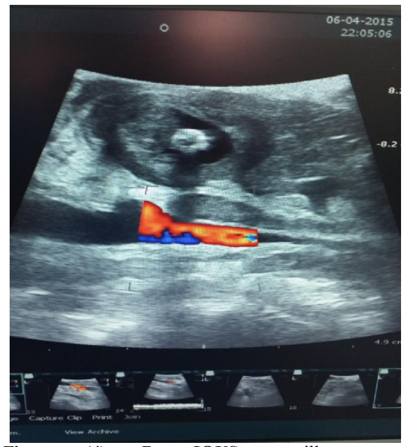
Figure (4): By IOUS, ampillary mass infiltrating duodenal wall, abutting SMV, PV and PV confluence and encroached on the distal CBD.

In four patients there was a tumoral encroachment of the portal vein but with line of cleavage; one patients showed a tumoral encroachment of IVC ; 2 of them showed a tumoral encroachment of the superior mesenteric vein with signs of omental cancer; 23 patients had some central positive loco-regional lymph-nodes which could be detected by CT exam.