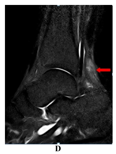
Figure 1 (A-D): Axial T1WI (A), sagittal T2WI (B), sagittal STIR (C & D) images respectively demonstrate complete thickness rupture of the distal Achilles tendon fibers located 52 mm proximal to the calcaneal attachment (arrow) with gap measuring 15mm in length. Surrounding soft tissue edema is noted (red arrow).

CASE 2: Male patient 30 years old presented with left ankle pain sever on walking had history of recurrent trauma.