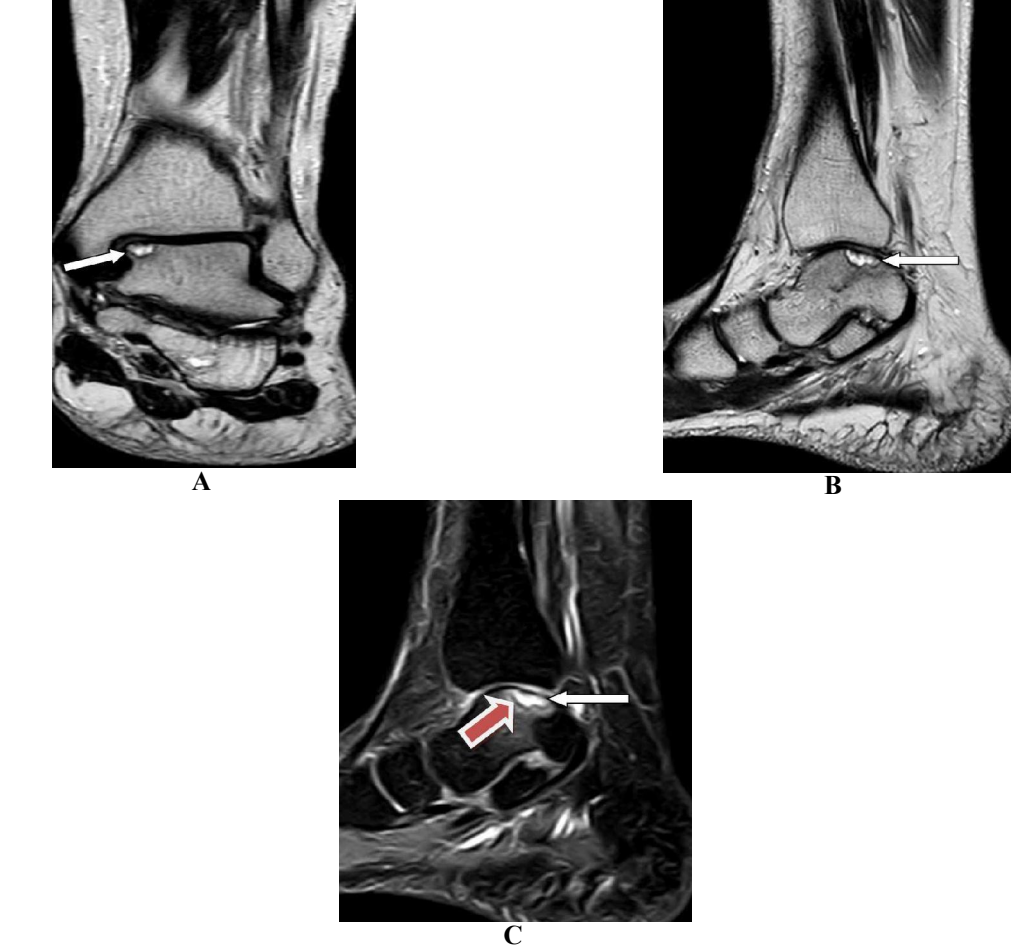
Figure 2 (A-C): Coronal T2WI (A), sagittal T2WI (B) and sagittal STIR (C) images show high signal sub-chondral focal lesion at upper medial part of talus bone (arrow) with hypointense line surrounding it (red arrow in C), denoting osteochondral defect of talus.

CASE 2: Male patient 30 years old presented with left ankle pain sever on walking had history of recurrent trauma.