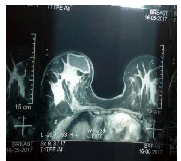
Figure (1): MRI showing Rt granulomatous breast mass

echogenic fat lobules in 28 patients, fluid collection in 12 patients. Mammographic examination was done for 4 patients revealed ill-defined mass with indistinct margins. MRI was performed in 2 patients either due to equivocal sonomammographic results or marked increase of breast density.