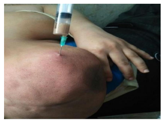
Figure (4): Pt. presented with abcess and its aspiration.

For 12 patients presented with abscess, drainage and tru-cut biopsy were done for all patients.