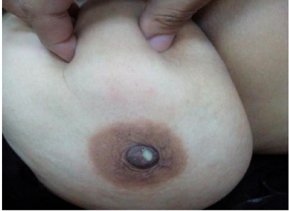
Figure (3): Pt. presented with mass.

The general plan was to control the inflammatory disease process, prior to surgical intervention. Different treatment modalities were applied according to clinical presentation. 24 patients presented with mass, 4 with pain and overlying skin changes and 12 patients with abscess.