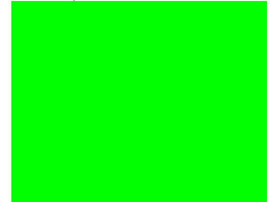
Figure 3: Part B survey questions on the ways in which physicians relate with their co-workers, the problems they face during patient examination as well as best stress relief and prevention methods ( Supplementary Table 1 )