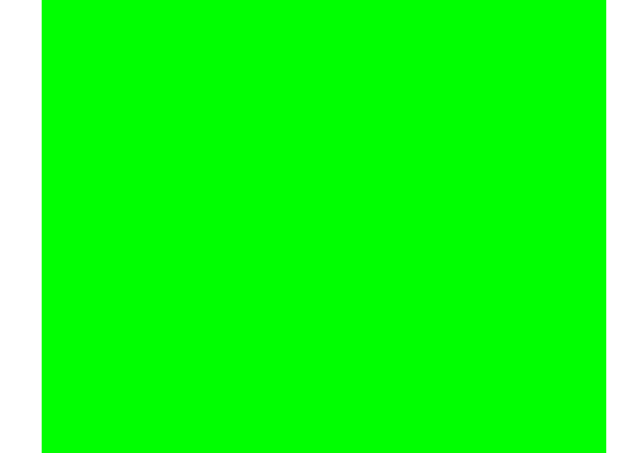
Figure 4: Questions 14 and 15 of the survey questionnaire on the factors affecting the performance of employees at the workplace based on ranks from the one with the highest impact to the lowest impact and the problems that doctors generally face at the hospital, respectively.