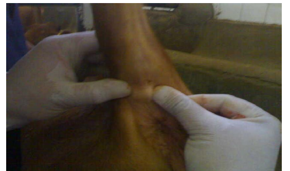
Photo (5): Post vaccinal reaction in calves vaccinated with LSD vaccine