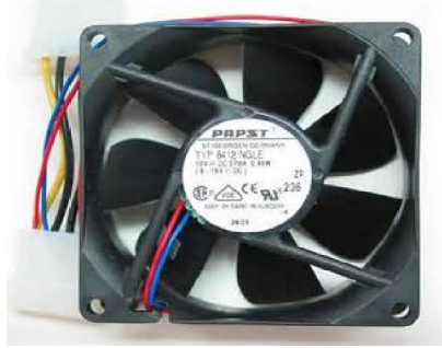
Plate 5: Fan

This is another essential part of the brooder; the fan is 12x12 in dimension. The fan performs two functions, which are; circulation of the heat in the brooder cage to prevent segmentation of heat and also disperses heat by blowing out air through the holes around the structure.