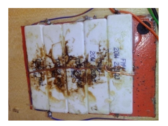
Plate 2: Heater

below the expected temperature at a particular moment by the use of the TRIAC, which is the electronic switch that regulates the temperature. The total number of heaters used is 20 pieces which is 5 heaters in 4 places and screwed to the structure (Brooder) but separated by an insulating material to the wood.