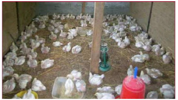
Figure 1: Manual Brooding management

According to Achi (1992), brooding refers to the period immediately after hatching when special care attention must be given to chicks to ensure their health and survival and the process by which heat is supplied to newly hatched chicks, until such time that their thermo-regulatory mechanism is functional.