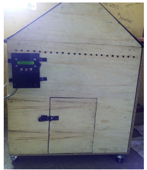
Plate 1: Housing Structure

The Dimension of the structure is 62x62x87(cm) with Door 23x34(cm) and water tray which is made of plastic is 35x30x2(cm). Small holes are put around the box for ventilation and under the structure where four tyres for easy handling.