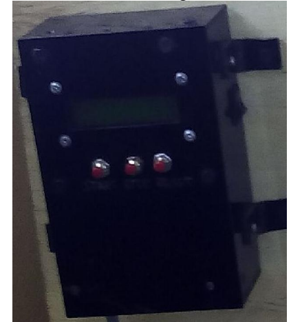
Plate 8: Panel Box

This is a metal box that serves as an encampment or housing to the panel and the microcontroller in the box. It is sized as Length -11 cm at the top, Breadth -10 cm at the bottom and the Height -6.5 cm.