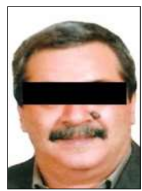
Fig. (1) Asymmetric pigmented skin tumor composed of one brownish-black plaque near to the nose.

The H&E stained section reveled, islands and sheets of columnar cells which showing deeply staining nuclei with some mitotic figures. The periphery of the cell nests was composed of well polarized cells, that are strongly suggestive of cells of the basal layer of skin (Fig. 2) carful search for nevus cells in many serial sections was not successful.