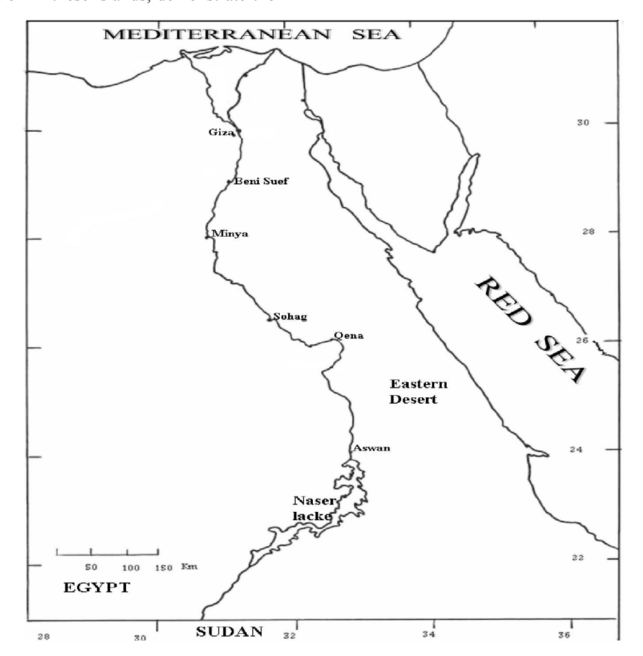
Figure (1). Location of the studied region ( Beni-Suef governorate) and the compared ones.

The studied area. Beni-Suef Governorate, is located about 90 km south of Cairo (latitude 28° 36' to 29° 26' N and longitude 30° 36' to 31° 21' E). The climatic features of the studied area was characterized by rainy season stretches from November to April with a total annual rainfall of about 7.8 mm. The mean air temperature varies between 12.2°C during January and 29.1°c during July. The mean relative humidity ranges between 35% and 57% in May and December respectively (Hegazy et al., 2004).