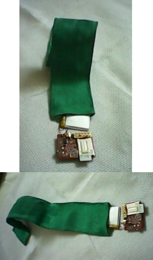
Figure 7 showing the tracking system inside the belt.

As a researcher suggests that toddler tag to be added as a reserve to child clothes to follow if a malfunction occurs in the main device or kidnapper discovered it.