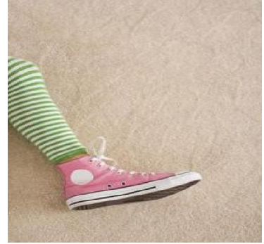
Figure 1. showing Some GPS tracking devices are small enough to fit in achild's shoes.

Equipping shoes with GPS tracking devices is one way to help parents put their minds at ease. parents' who losing their children, whether in a busy or through abduction. Many look for ways to ensure