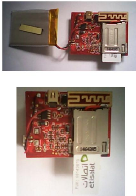
Figure 5. Shows the tracking system with cell phone

After The illustration, the researcher used GPS tracking system provided with cell phone can send text message to the parents mobile if the device is out of range and they can hear their kids voice, As shown in figure (5).