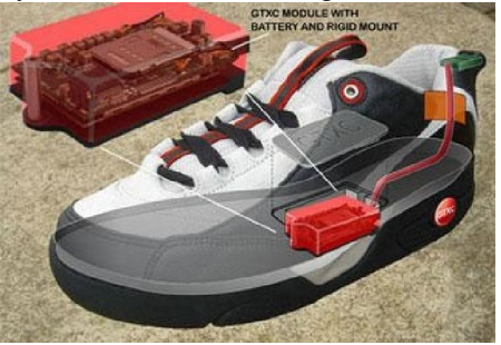
Figure 2.showing the tracking shoe

incorporate a small and robust GPS tracking device which hooks up with GTXC's internet user portal to offer a very compelling array of personal location services. The portal enables caretakers to easily define safe zones or un-safe zones or geographical boundaries on a Google Earth map and to set up cell phone alerts if a perimeter is breached by the wearer. This should significantly benefit caretakers of children and the elderly, as they can easily customize their monitoring and text location alerting through a simple "set it and forget it" system. The shoes also employ assisted GPS for enhanced indoor location accuracy, and will transmit for days before a recharge is needed. The intelligent power source enables a guardian to track the whereabouts of a loved one and the performance and status of the device itself from any handheld as shown in figure 2.