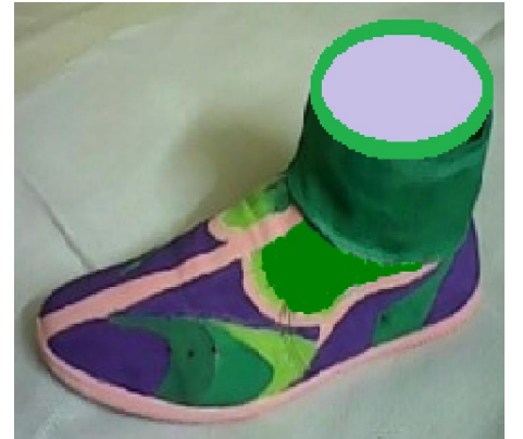
Figure 6. Shows the the prototype of the proposed designed shoe

The researcher used this system and made the shoe prototype model and performed the design by the materials and the appropriate dimensions as well as the design is provided with the system in special belt, as it is shown in the figure(6) and figure7 showing the system inside the belt.