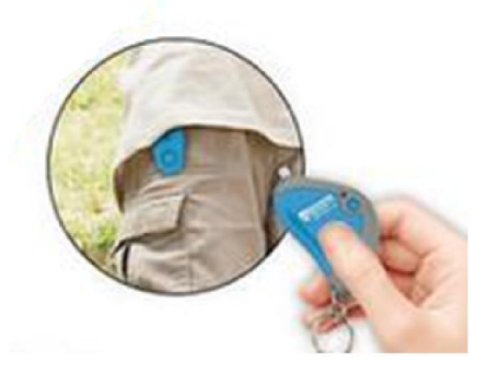
Figure 3.showing the toddler tag

The moment of child wanders 30 feet away from transmitter, parents'll receive an instant alert which will make it easier for parents to find her. Additionally, they can push the button on their transmitter to sound a loud alarm on their child's receiver unit.