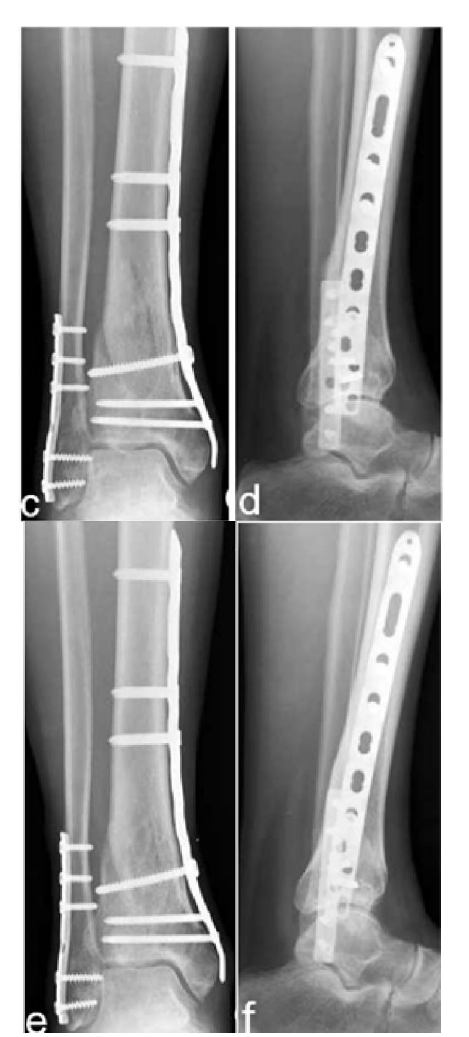
Figure 3: (c-d) 2 weeks Post operative radiographs shows the distal tibia stabilized with LCP using minimally invasive technique and the fibular fracture stabilizes with semi tubular one third plate using ORIF technique, (e-f) Fifteen months postoperative radiographs shows successful union with good alignment.

Lag screws were then placed across the fracture planes to maintain the reduction, to provide inter fragmentary compression, and to increase the stability of the construct. Post-operatively the limb was maintained in the elevated position while the patient was in bed and ambulation begun on first post-operative day in the form of toe-touch weightbearing with crutches. On second post-operative day, gentle exercises for the ankle were begun. Radiographs, including anteroposterior and lateral views were taken at 2weeks, 6 weeks and 3 months post-operatively (Figure 3) to assess healing and alignment. Partial weight-bearing started depending upon their clinical and radiographic evaluation, but in