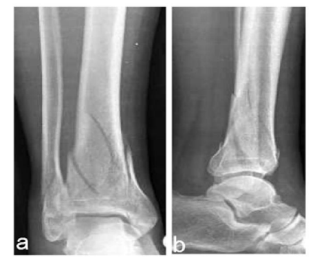
Figure 1: (a-b) Preoperative radiographs of 39 year old man shows distal tibial and fibular fractures classified as AO/OTA type C1

additional investigations when indicated. The average injury surgery interval was 3 days range from (1 to 8 days post injury).