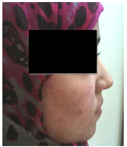
Fig.(3): patient with acne vulgaris before the treatment by PDL.

the patients) showed mild improvement and only 1 patient (5% of the patients) showed moderate improvement.