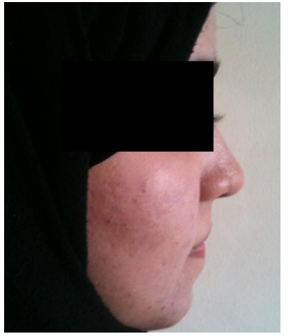
Fig.(4): patient with acne vulgaris after the treatment by PDL.