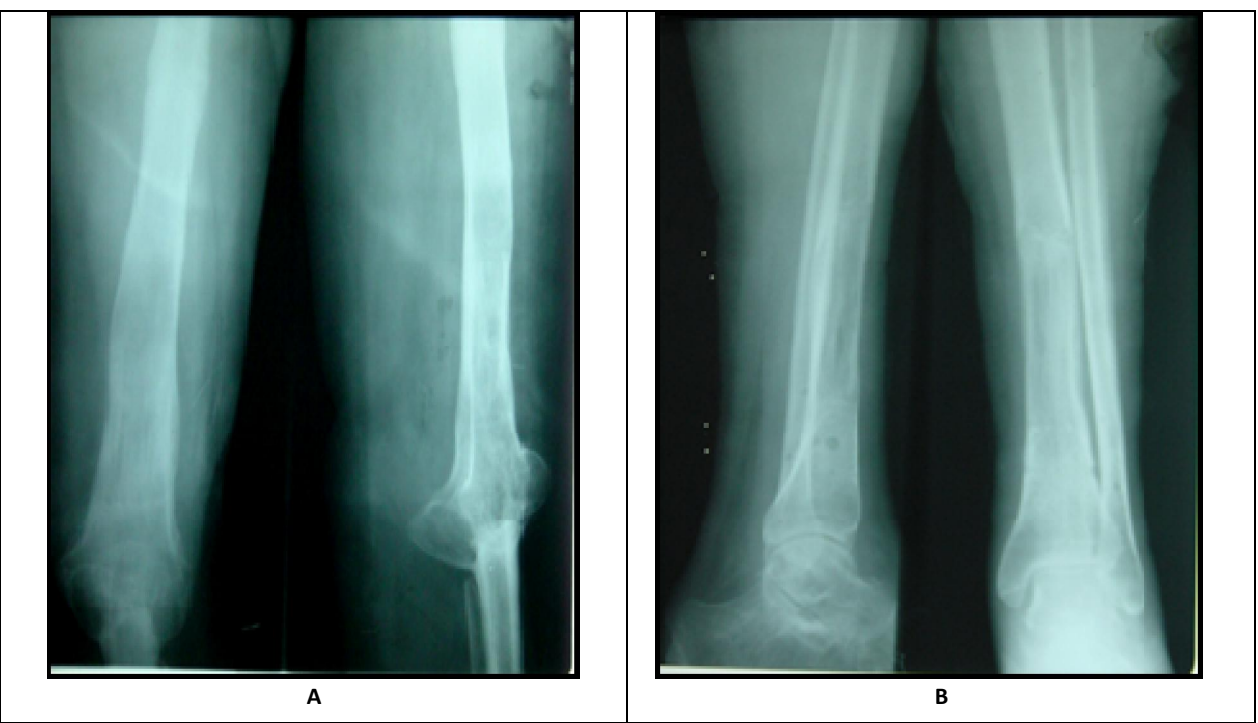
Figure (4): (a) Anteroposterior and lateral views of the femur and knee after removal of the ilizarov device showing complete consolidation of regenerate of the femur with sound fusion of the knee joint. (b) Anteroposterior and lateral views of the tibia after Ilizarov removal with complete consolidation of regenerate.