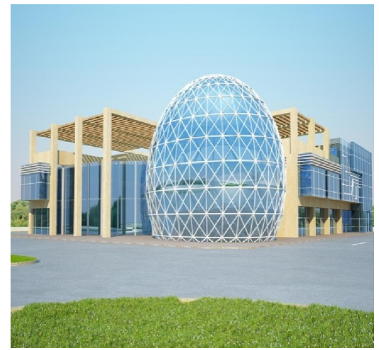
Figure 2. Architectural design of Al bogary Plaza

The principle of the energy balance is described in terms of the energy needs, delivered energy and primary energy for all types of conditioning or all types of building service (Figure 3) (heating, cooling, ventilation humidification, lighting and domestic hot water supply). Each balance of energy flow follows the same procedure. The delivered energy is calculated from the energy needs of the building and the system losses due to control and emission, distribution and storage in addition to the losses due to energy generation for the individual conditioning modes. The primary energy is calculated from the delivered energy evaluated per energy carrier using factors relating to its environmental performance. In the following model, each step of the calculation is described only once. When using calculations in actual conditions, however, individual steps may need to be used several times.