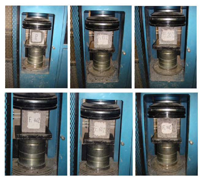
Fig. 5. Loading of cubic specimens with a percentage of 0, 10, 20, 40, 60 and 80, by total weight of the fine aggregate in concrete.