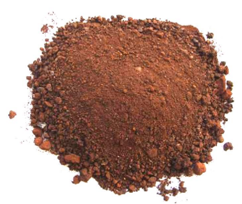
Fig.1. Sample of Incinerator Ash.