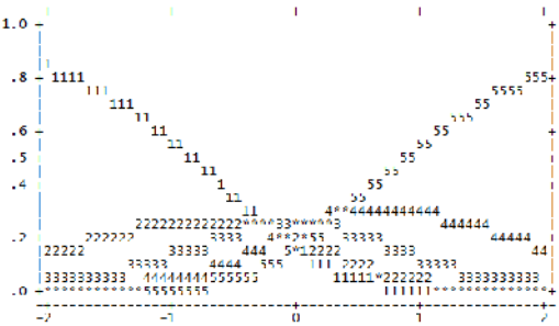
Figure 1. Category probability: Modes_ Structure measure at intersections (12345)

In order to maintain the category sequence and improve fit to the model, the researchers attempted several configurations including three and four category scales; however, the 12223 pattern produced the best indices. Consequently, they decided to integrate the adjacent categories 2, 3 and 4 into 2 and shift the 12345 category pattern (5-point scale) to 12223 (3-point scale) (Table 3, Fig 2).