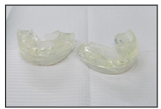
Fig (6): 7mm and 11mm ready-made BOs.

Patients of this group were treated by ready-made bite openers (BOs)<sup>6</sup>, which were made of a soft flexible silicone material and were available in two degrees of vertical jaw separation. The first provides 7mm, while the second 11mm vertical jaw separation. These separations represent the stages of the BO ( Fig.6 ).