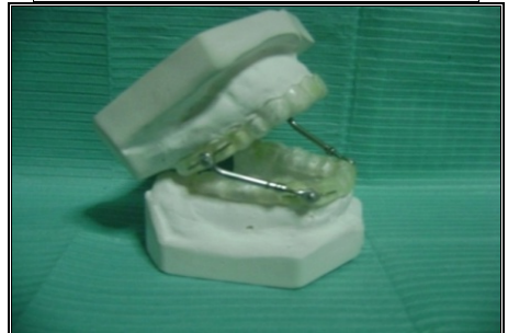
Fig (3): Adjustable guiding telescopes. Fig (4): The MAD appliance placed on master casts.

6) Finally, the appliance was delivered to the patient after being adequately checked for fit, retention, proper closure in the predetermined position and for smooth uninterrupted gliding during different mandibular movements ( Fig.5 ).