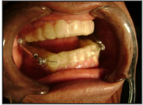
Fig (5): The MAD appliance in patient's mouth.

6) Finally, the appliance was delivered to the patient after being adequately checked for fit, retention, proper closure in the predetermined position and for smooth uninterrupted gliding during different mandibular movements ( Fig.5 ).