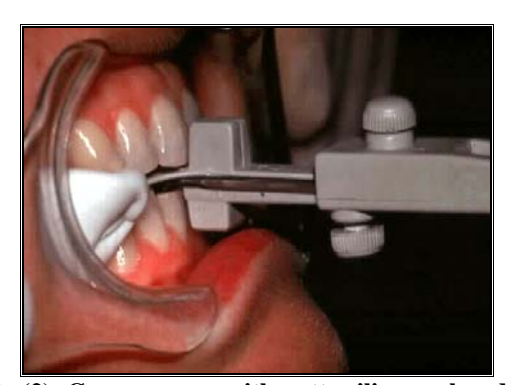
Fig (2): George gauge with putty silicone placed in patient's mouth.