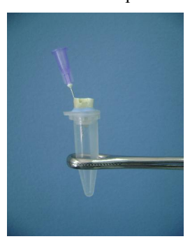
Fig. (1): A photograph showing the collecting apparatus

<u>3-Cleaning and shaping:</u> Before the initiation of root canal instrumentation, each sample was fixed from the apical end through the removable top of a polyethylene tube. A syringe needle was inserted in the tube's top next to the fixed root to equalize the external and internal pressures (fig.1). This tube acted as collector for the debris and irrigant produced during instrumentation. Each tube was weighed before instrumentation using a microbalance (Sartorius Analytical, Gottingen, Germany) (W<sub>1</sub>). The values were recorded in terms of gram fractions. The top with the attached root was positioned on the preweighed tube so that the root was suspended within the tube.